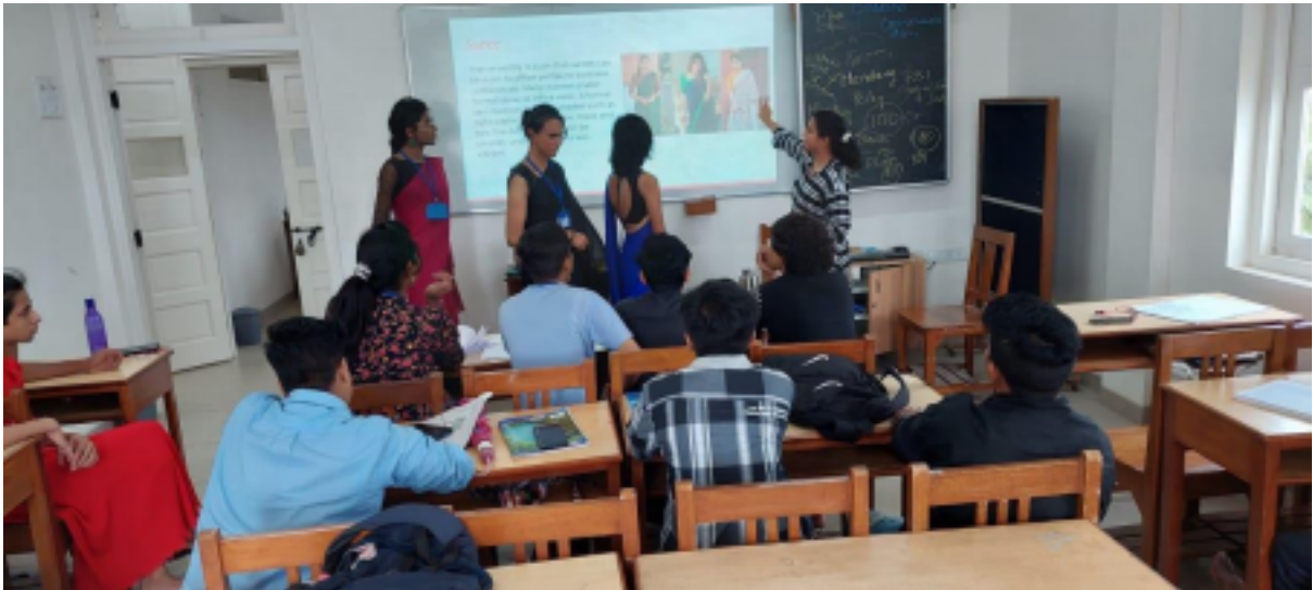
English Literacy class