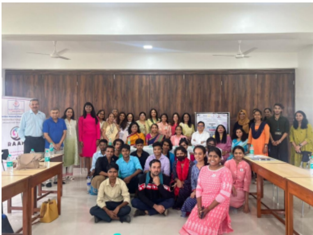
Project RAAH Launch Event