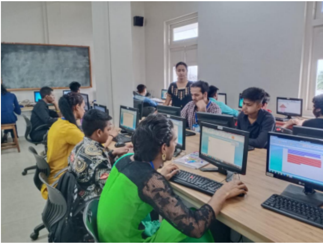
Digital Literacy Class