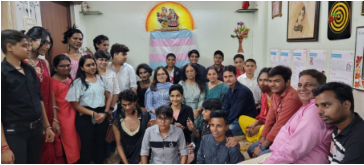
Team RAAH's visit to Garima Greh with Rotary members and Mentor.